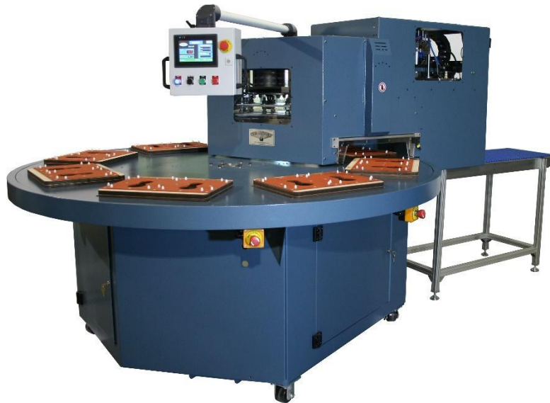
ERB8 Rotary Blister Sealing Machine shown with optional attached finished package unloader, unload conveyor and casters